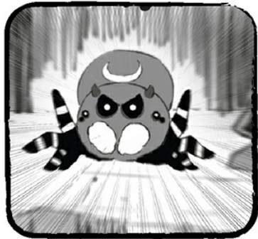
Mister Crawly Wawly

A high elf Singer of the Trees capable of controlling plants. Brimming with endless curiosity, she has been through countless adventures during her long life.