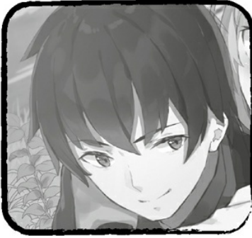
Red (Gideon Ragnason)

Kicked out of the Hero's party, he headed to the frontier to live a slow life. Although not as powerful as Ruti, he's one of humanity's greatest swordsmen, with many feats to his name.