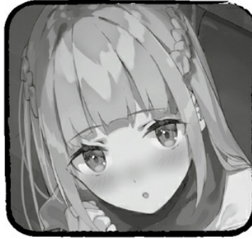
Rit (Rizlet of Loggervia)

Kicked out of the Hero's party, he headed to the frontier to live a slow life. Although not as powerful as Ruti, he's one of humanity's greatest swordsmen, with many feats to his name.